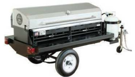
Trail Boss 1 Ready For Travel