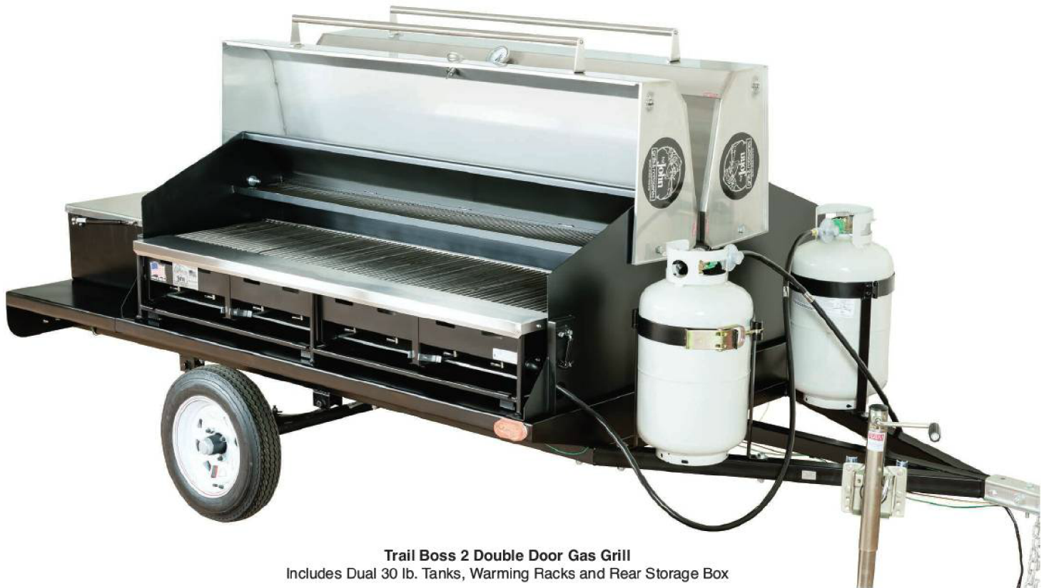
Trail Boss 2 Double Door Gas Grill Includes Dual 30 lb. Tanks, Warming Racks and Rear Storage Box