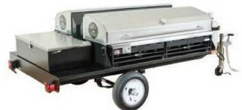
Trail Boss 2 Ready For Travel

www.BigJohnGrills.com/Products/TrailBoss2