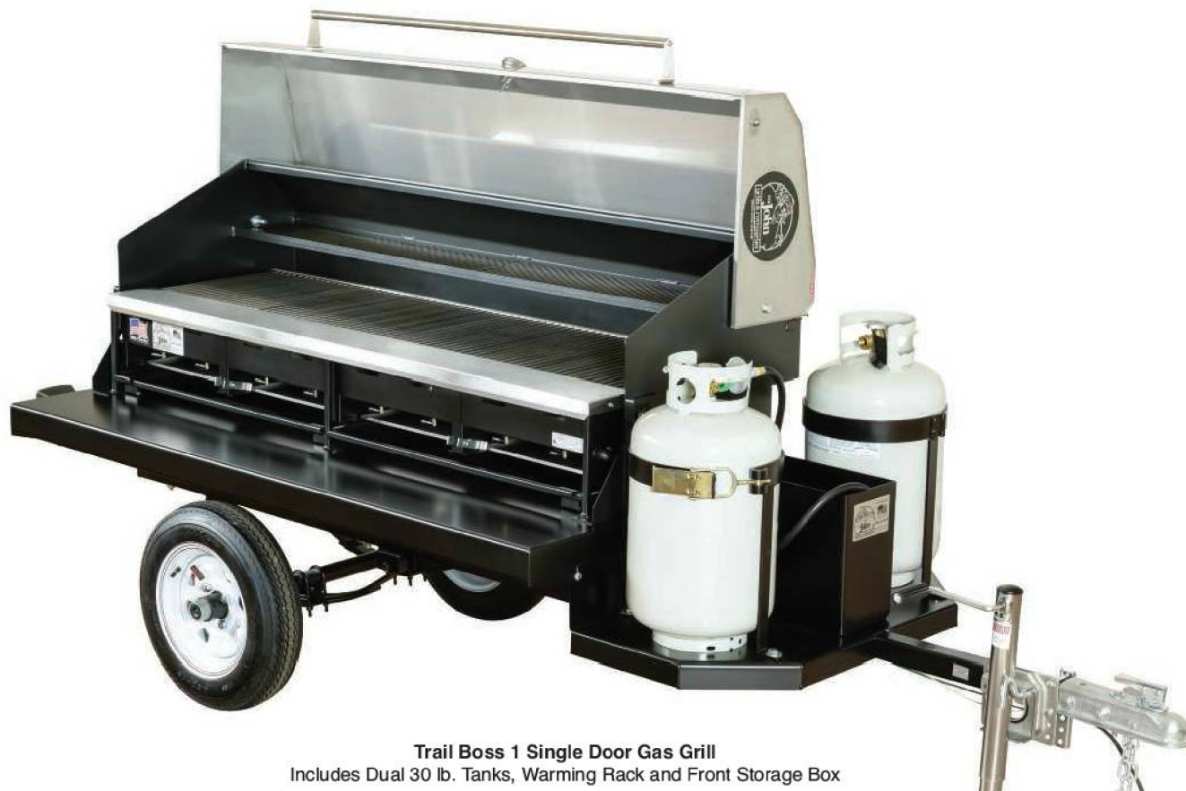
Trail Boss 1 Single Door Gas Grill Includes Dual 30 lb. Tanks, Warming Rack and Front Storage Box